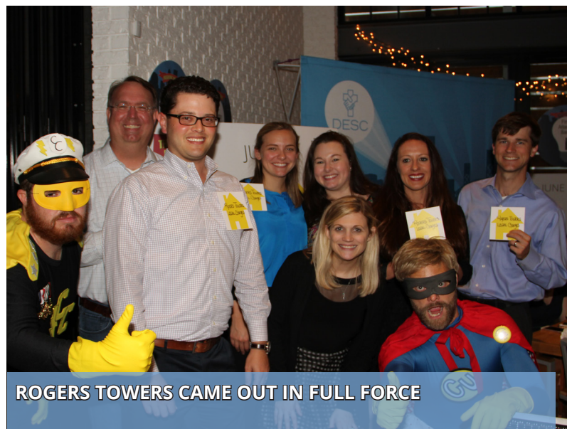
ROGERS TOWERS CAME OUT IN FULL FORCE