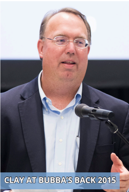
CLAY AT BUBBA'S BACK 2015