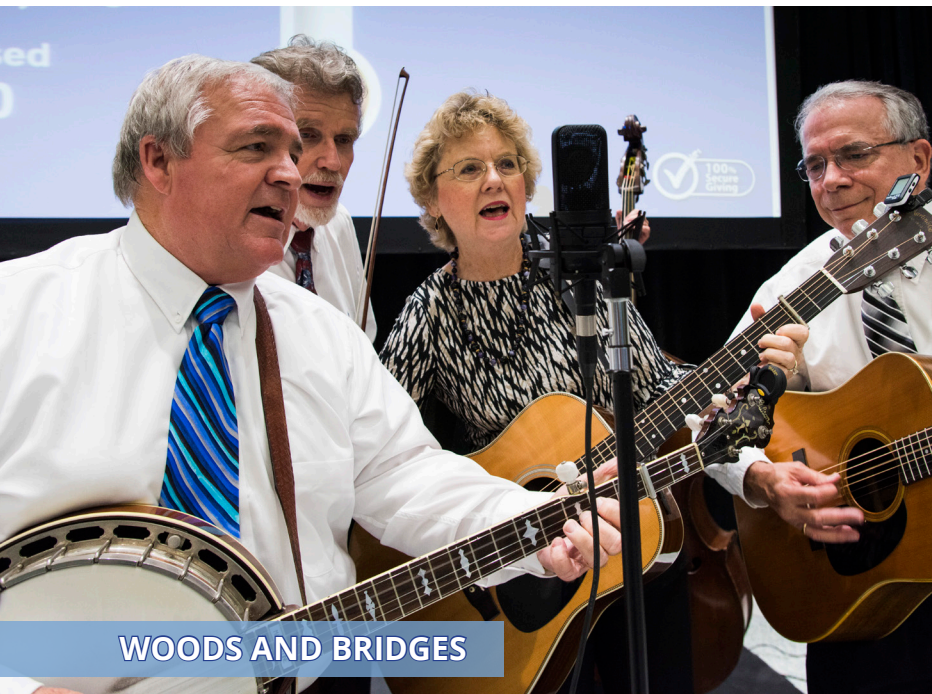
WOODS AND BRIDGES