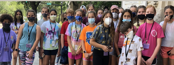
Students helped unload food and sort clothing from the church's "Undie Sunday"