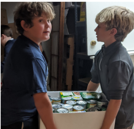
Riverside Presbyterian Day School food drive.